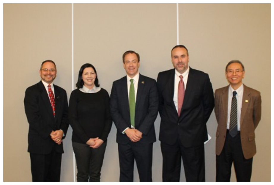
Mid-America Transplant representatives attended the Colloquium

• Please join me in congratulating the School of Architecture (SOA) Public Safety Management (PSM) program for its articulation agreements with City College of Chicago, Chicago, IL. The