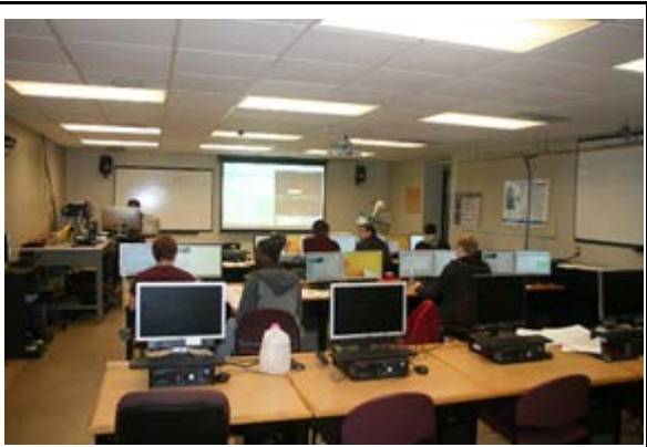
Security Dawgs team during competition