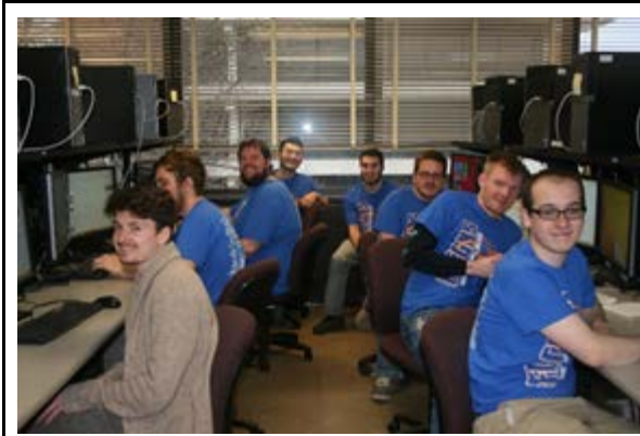
Southeastern Illinois College (SIC) Team