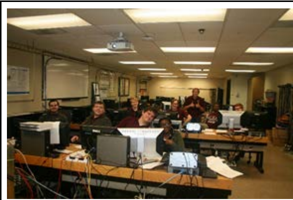
SIU Security Dawgs Team before competition