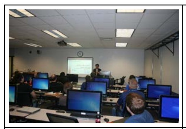
Presenting the future of IT – the Internet, IoT, & IoE – at SIU ISAT