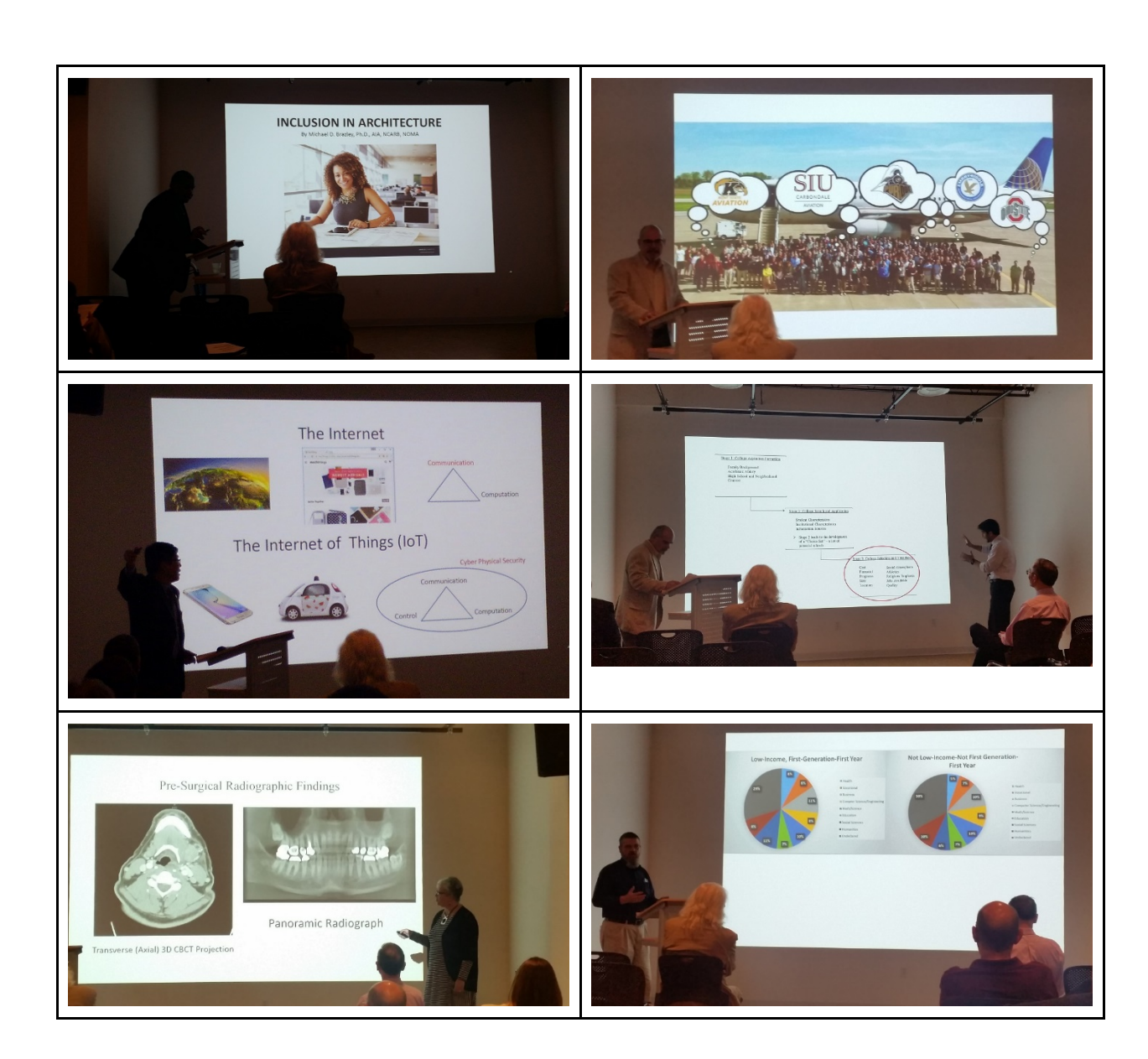
A complete list of presentations and presenters is available at \underline{ http://research.asa.siu.edu/CASA\%20Faculty\%20Flash\%20Talks/index.php}.