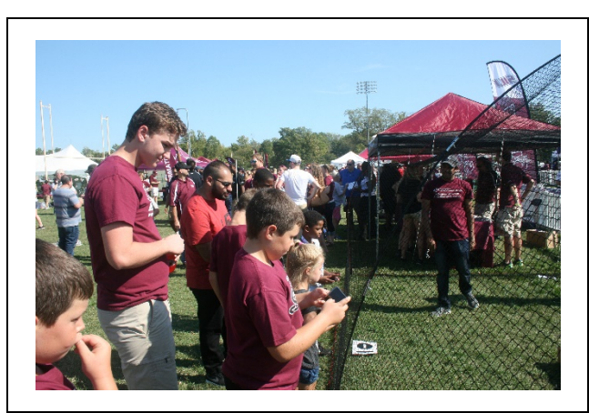
The drone cage was a popular stop for many visitors.